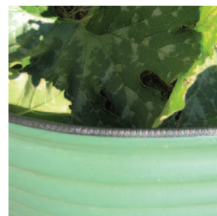
Edge trims – optional.